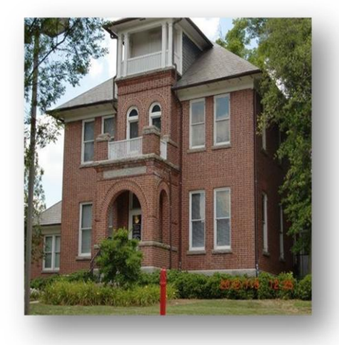
MacVicar Hall 2<sup>nd</sup> Floor Services: Free and Confidential Hours of Services: Monday-Friday • 9am-4:30pm Unscheduled Walk-In Session: Monday -Thursday • 9pm-2pm Friday • 9am-12pm Scheduled Appointments: Tuesday-Thursday • 10am-3pm

Refer or walk the student to the Counseling Center.