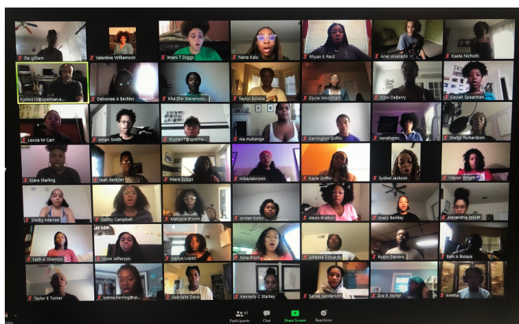
Glee Zoom Rehearsal

This newsletter will keep our alumnae, family and friends in the loop of all things glee! We look forward to sharing with you all and we hope you all feel the love of Glee through Resonance!