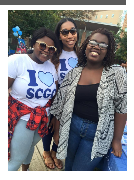
SCGC FOR LIFE GLEE SISTERS ROCK SCGC PARAPHERNALIA DURING MARKET FRIDAY.