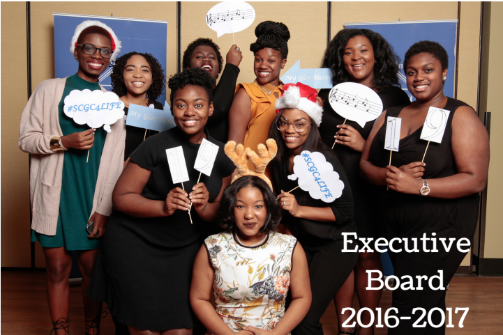
Executive Board 2016-2017