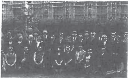
"A close accord between our two countries is essential to the good of mankind in this turbulent world of today, and that is not possible without an intimate understanding of each other. These scholarships point the way to the continuation and growth of the understanding which found its necessity in the terrible struggle of the war years" George C. Marshall